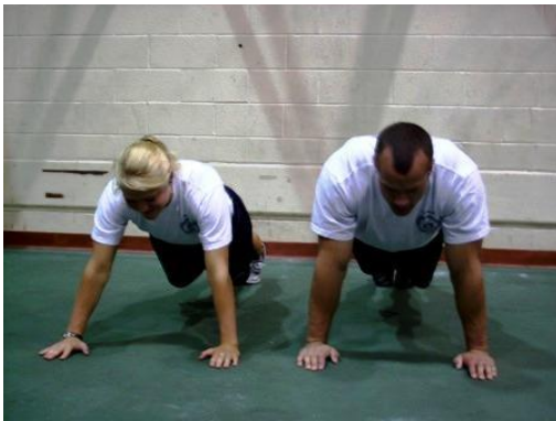
Figure 1 Proper Up Position

Scoring: Record the total number of properly executed push-ups. If the candidate is able to stay with cadence for two minutes, the maximum raw score is 60.