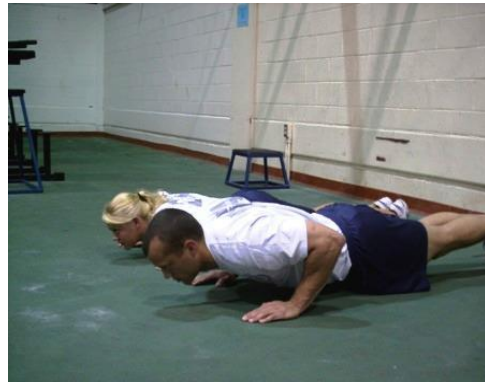
Figure 2 Proper Down Position