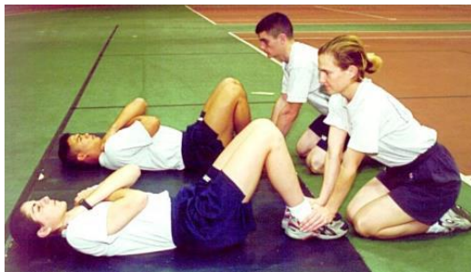
Figure 3 Start/Finish Position

Scoring: Record the number of properly executed sit-ups performed in a two-minute period.